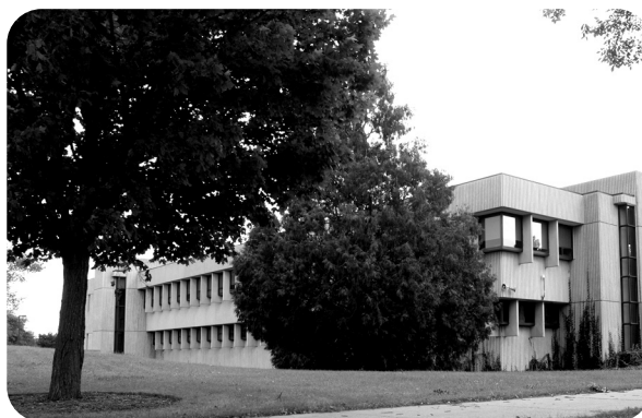
Central Michigan University's Foust Hall houses the Office of Research and Graduate Studies.